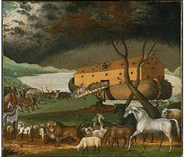
Noah's Ark (1846 painting by Edward Hicks)

At the conclusion of this parashah, however, we read about a man named Noah, who would somehow bring comfort. This is a Hebrew word play on the name Noah נֹחַ, which means 'comfortable'.