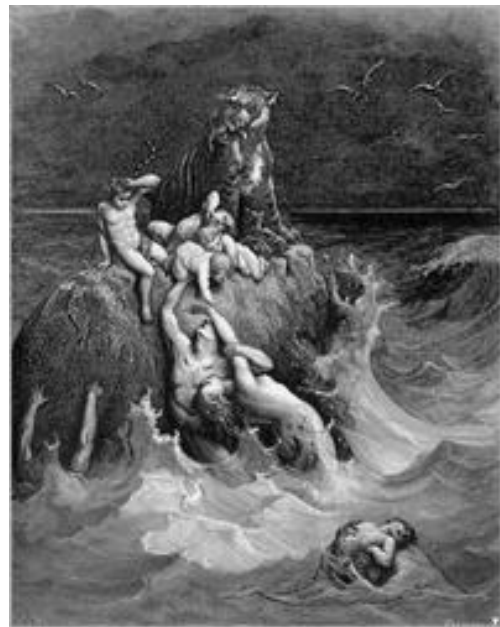
The Deluge (illustration by Gustave Doré from the 1865 La Sainte Bible )