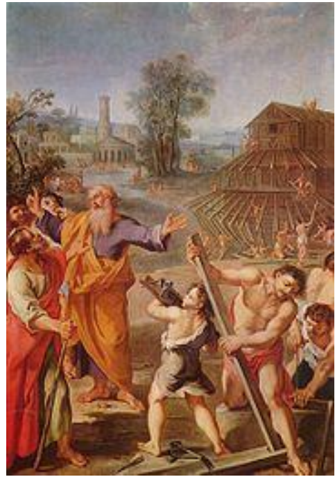
The Building of Noah's Ark (painting by a French master of 1675)

God instructed Noah to build a great ark (called a teivah תִּיבָה in Hebrew), and to seal it inside and out with pitch (tar) in order that it would float on the water and keep everything dry within. A terrible deluge of water was about to come, God warned Noah, which would wipe out every living thing on earth except for those saved on the ark.