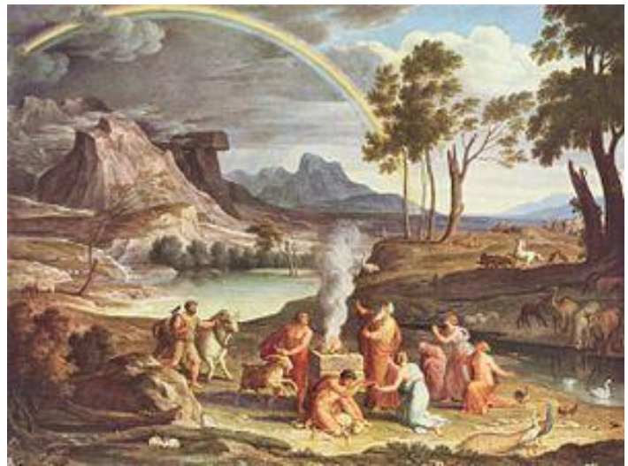
Landscape with Noah's Thank Offering (painting circa 1803 by Joseph Anton Koch)

“And the LORD smelled a soothing aroma. Then the LORD said in His heart, “I will never again curse the ground for man’s sake, although the imagination of man’s heart is evil from his youth; nor will I again destroy every living thing as I have done.” (Genesis 8:21)