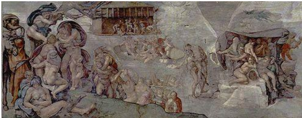
Noah's Ark floats in the background while people struggle to escape the rising water of the Flood (fresco circa 1508–1512 by Michelangelo in the Sistine Chapel )

Most of us know that a great judgement and destruction is coming upon the world. But many people still continue on with life as usual, completely unaware of what is coming, just as was in the days of Noah before the flood.