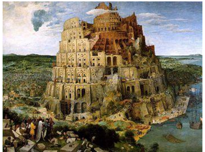
The Tower of Babel by Pieter Bruegel the Elder (1563)

The tower of Babel (Bavel) was built in the land of Shinar which is in Babylon (Iraq). The people of the world unified in their goal of building the tower of Babel, but their motives were not godly. Therefore, God was forced to bring confusion to their languages to destroy their works. Bavel בבל in Hebrew means confusion. It is from this word that we derive the English term ‘to babble’.